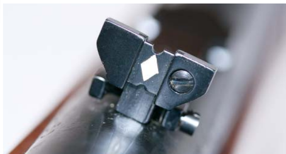
Above: A nicely designed adjustable rear sight that folds forward for scope mounting.