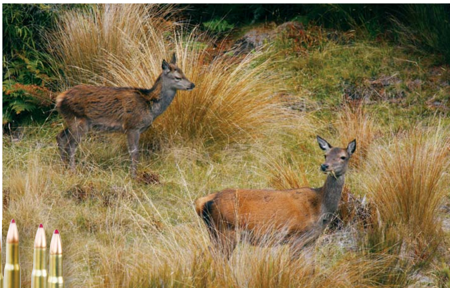
Above; The 30-30 is still a valid calibre for bush hunting and if you can get close enough, like this red hind in the Ruahines, it will do the job effectively. Left: The 170 grain Hornady Lever Evolution ammunition used in the 464.

I only used Hornady Lever Evolution ammo in my testing. I guess it would have been fair to try other ammo however the rifle shot about how I would expect a good lever action rifle to shoot. The fact that the magazine tube is clamped to the barrel and stock means that as the barrel heats up on a lever action it is common for points of impact to change. The largest group I shot at 100 yards was 90 mm. The best I shot was 78 mm. I am sure that with a little fine tuning and with handloaded ammo better accuracy could be achieved although I believe my results would be adequate and pretty standard accuracy from a lever action. The rifle functioned well which is one of the joys of shooting these rifles; there is no better feel than shucking shells through a lever-it leaves a bolt action for dead.