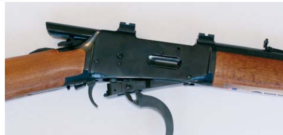
Above: Without the scope the Mossberg 464 is a ready to go pig gun. Top: The Mossberg 464 in 30-30 with the 30mm tube Shirstone scope in 4x36-plenty of magnification for a lever action rifle.

The first obvious difference to the Model 94 is that the bolt is round like a bolt action and slides home freely where it is locked by the falling block at the back. The next thing is the addition of a shot gun style push safety on the tang of the rifle-it is under your thumb on safe and out of the way on fire. The top of the receiver is open like the Winchester however the