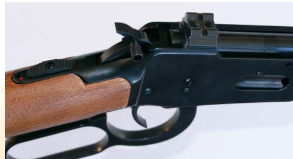
Above: The tang safety, hammer extension and Weaver mounting system on the Mossberg 464.

ejection system is angled out the side with an ejector plunger on the left of the bolt and an extractor similar to the Marlin on the right of the bolt. Mossberg have put a steel band at the back of the action for extra strength which also helps with the scope mounting.