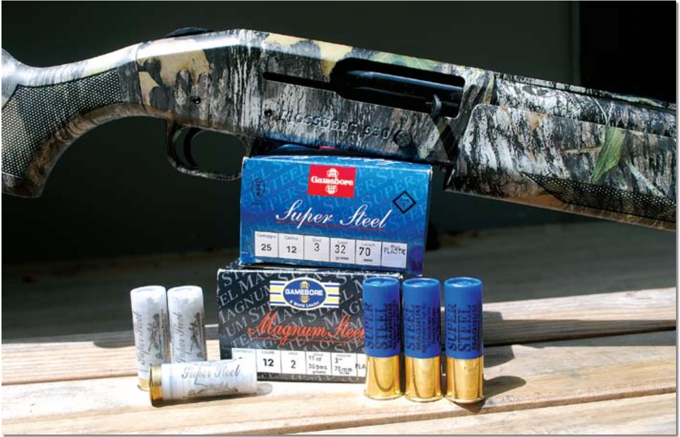
The Mossberg 930 is chambered for both 2-3/4" and 3" loads, and is steel shot compatible.