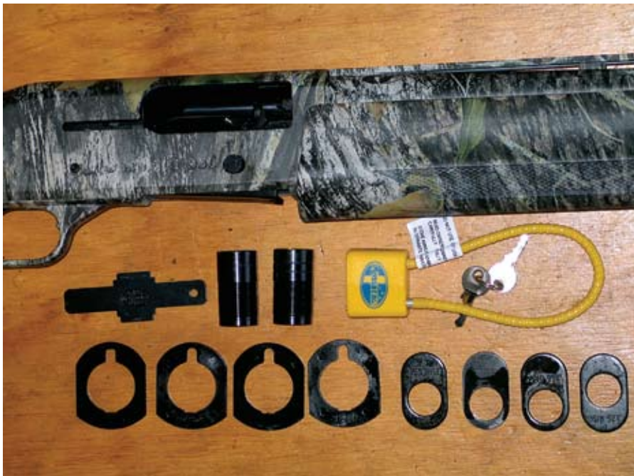
Three chokes, a spanner, a cable lock, and a set of stock-adjusting spacers are part of the Mossberg package.

The Mossberg comes with a set of stock-spacer adjusters. If the stock drop of any gun is set up wrong for you it can make a big difference to your shooting. Not only will the gun fit you awkwardly, but you'll fail to hit the number of birds you deserve to, and probably have to cope with more recoil problems than you need. Most manufacturers set their shotguns up for the mythical