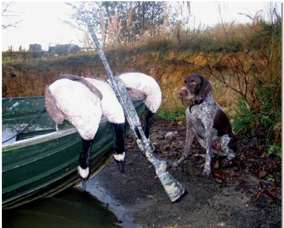
A good gun and a good dog add up to plenty of geese in the freezer...

Unusually, this shotgun is drilled and tapped for a scope mount base. In their