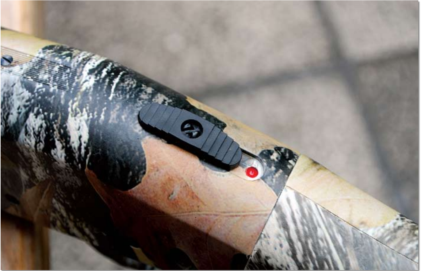
It's unusual to find a tang-mounted safety catch on a semi-auto shotgun, but particularly handy if you're a left-handed shooter. Note the screw just showing at top left – the 930's receiver is drilled and tapped for scope mounts.

must be useful both for longevity, and also for maintaining proper headspace.