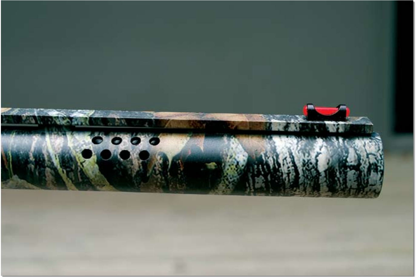
Muzzle ports help reduce barrel-jump, and the hi-viz fibre-optic front sight shows up equally well at dusk or on wet misty mornings.

magazine is full of duck loads and you hear a big honker coming down the lake. If the bolt is closed, don't push the bolt-release first to empty the mag (as one article suggested) or you'll end up with cartridges jammed firmly beneath the follower – a jam that might take several minutes to clear. I'd imagine that most of us, Homer Simpson aside, would only ever make this mistake once!