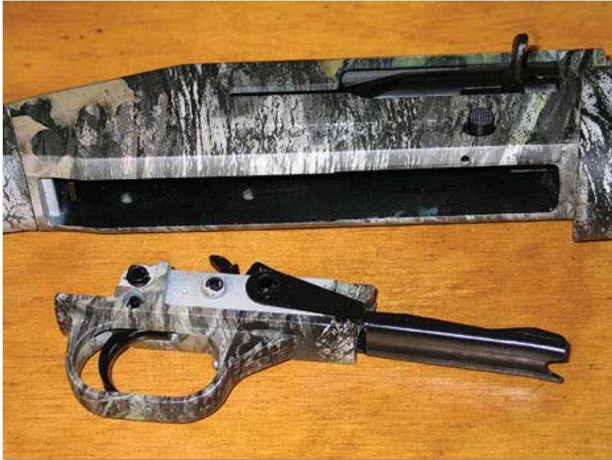
The Mossberg's trigger group is easily removed for cleaning by drifting out two pins in the receiver.