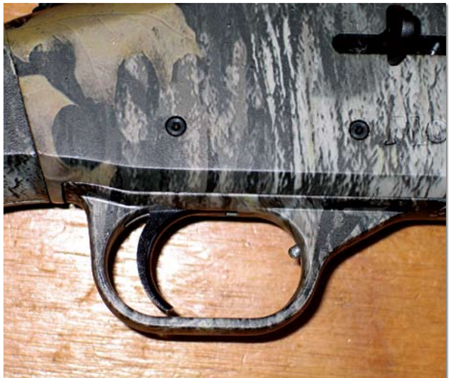
The protruding pin inside the trigger guard is a cocking indicator. It sits flush when the gun is uncocked. John found it to be a useful safety feature and wondered why more guns don't have one.

A feature unique to this gun is that the magazine can be emptied by simply pressing the bottom loading gate down and then depressing the bolt release. Out they all come. That's pretty handy when your