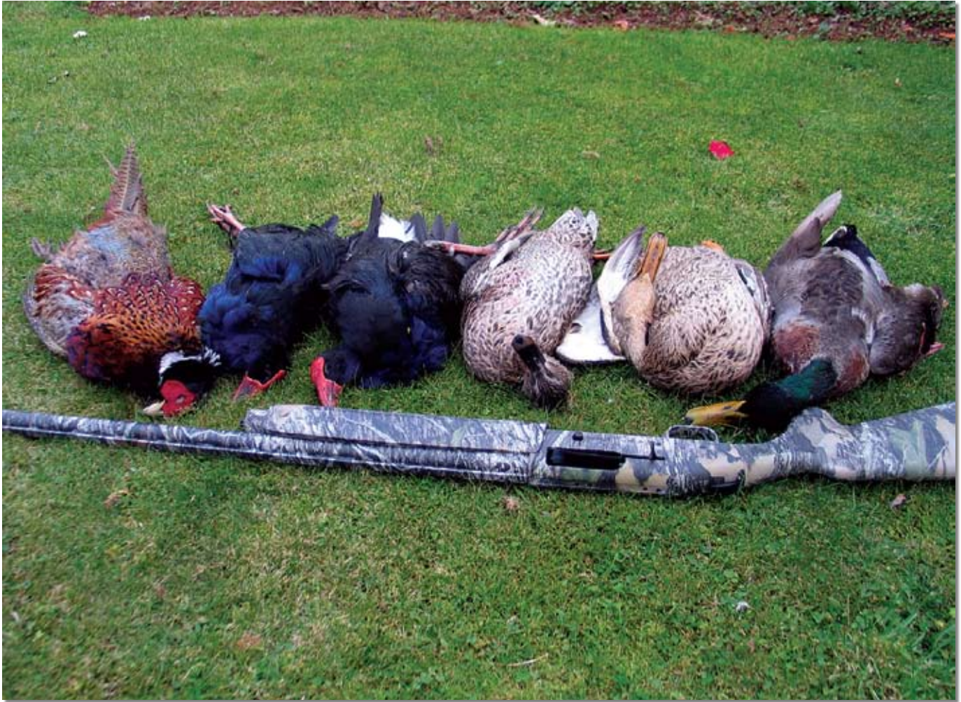
A variety of birds, both pheasants and waterfowl, fell to the Mossberg 930 during John's field tests.

marked on their sides (if you remembered your reading glasses), there are no external notches to show you at a glance which choke is installed in the gun.