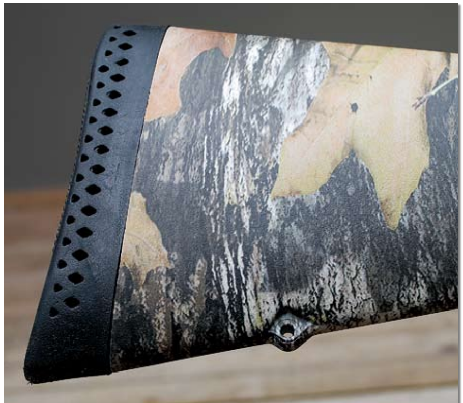
The ventilated butt pad makes life easy on the hunter's shoulder, and sling swivel eyes are provided too.

The top-tang safety catch may not be unique, but it's something found on few of the current crop of semi-auto shotguns. If you're a left-hander, or if there's one in your family who might also use this gun, it's a most valuable ambidextrous addition.